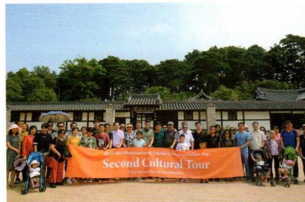
ISEF Cultural Tour

Asia Research Center 144 Xuan Thuy Road, Cau Giay District, Hanoi, Vietnam T. 84-24-3754-7670 (ext. 723) E. arc@vnu.edu.vn