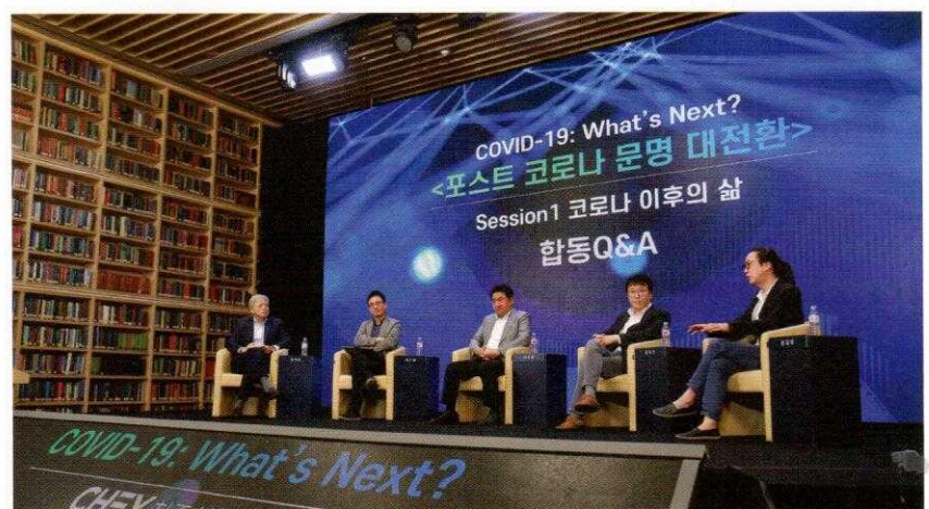
COVID19 Special Webinar Series