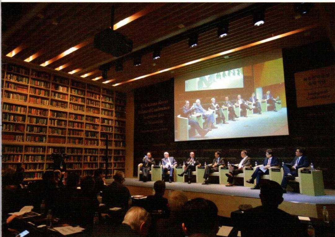
ROK-US-China Trilateral Conference

The Chey Institute supports the following international academic exchange programs.