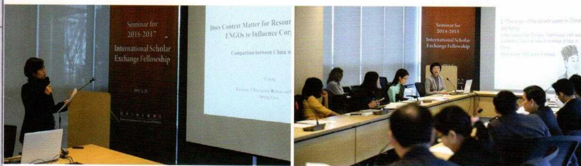
ISEF Academic Seminars