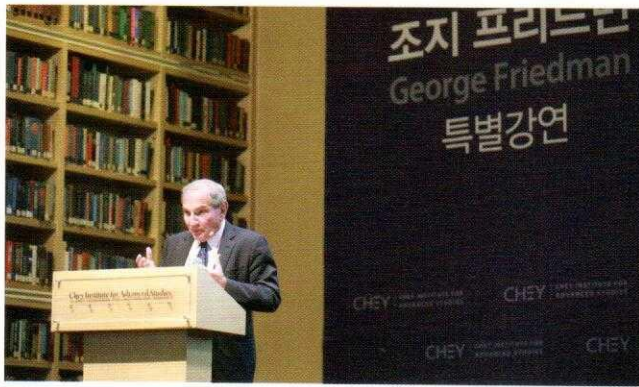
Special Lecture by George Friedman