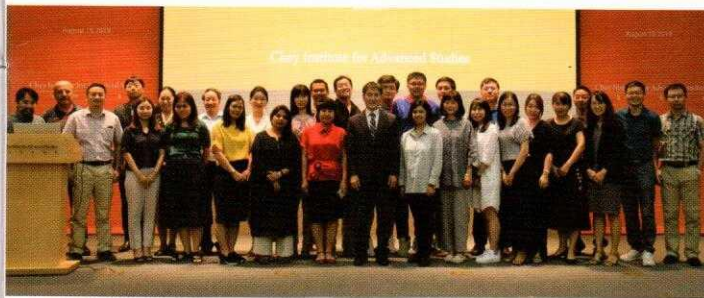
ISEF Farewell Ceremony