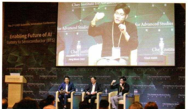
Scientific Innovation Conference