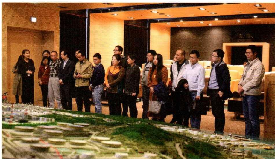
Visit to the SK Energy Ulsan Complex