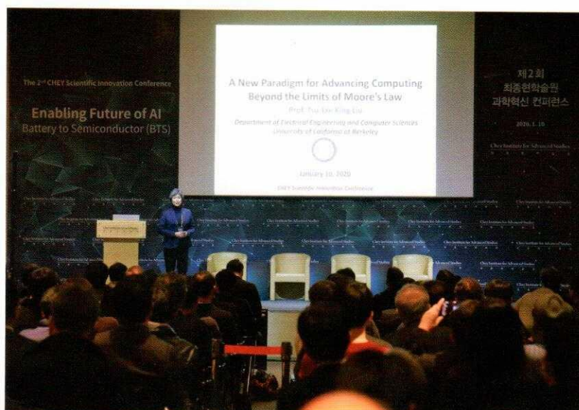
Scientific Innovation Conference