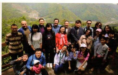
Visit to Afforestation Plant

the "Submission of Documents" page. A copy of your statement of proposed activity should be given to each recommender before this form is sent.